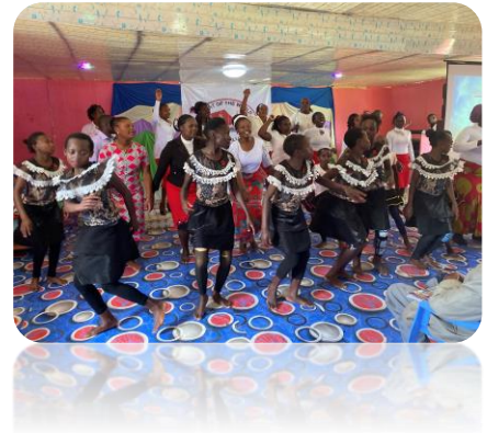
Our Dance Team at LOWCF International, Kenya

Parent/Teacher conferences are scheduled with each family to insure proper communication and awareness. However, teachers are available after school to answer any general questions and special conferences can be set up at any time to discuss your child's personal needs.